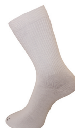
Sock Anklet 2pk