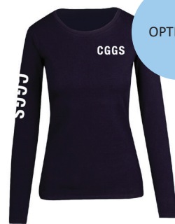
Long Sleeve Tee

For current prices, please refer to www.bobstewart.com.au