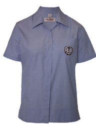
Short sleeve Blouse