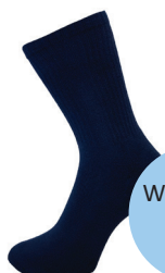
Socks Navy Crew 3pk